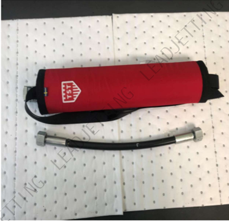
Picture 3: bursted High Pressure Hose with TST hose protection/ shroud, no damage visible.

Signed for and on behalf of TST-Sweden AB.